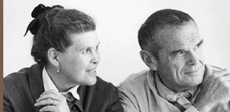
Designers Charles and Ray Eames

EAMES LOUNGE & OTTOMAN™ By Charles and Ray Eames