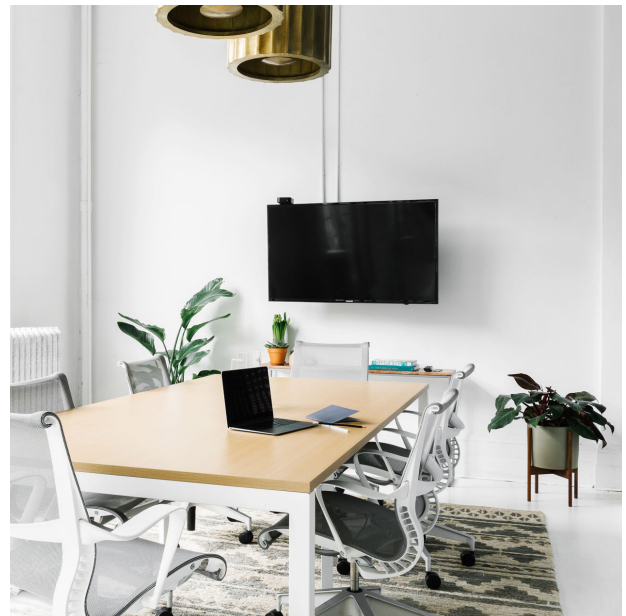
Natural light pours into a pair of Meeting Spaces, each outfitted with Layout Studio Tables and Setu Chairs, making them ideal for design reviews, when teams need to make decisions about colors and materials.