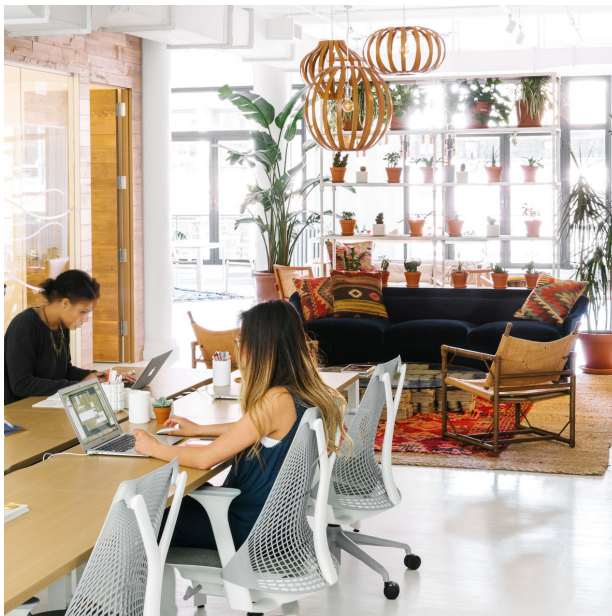
Soludos worked with Homepolish to integrate vintage pieces into the mix of Herman Miller furniture used to outfit the space, creating settings such as this Cove (background), which has the look and feel of a Montauk beach house living room.

At the outset, Herman Miller helped Soludos reevaluate how space might be optimized to both express the brand and support its people, as Brown says, "really trying to understand the challenges with the way that we used to work, and building a roadmap to efficiency within the office and organizational framework." The first step was to understand the needs of each employee and the activities of the various teams. Then, Herman Miller worked with Soludos on creating a purposeful variety of settings that could address those needs and activities—a main working area or Hive, formal Meeting Spaces, and additional settings for more informal gatherings. Simultaneously, the adjacencies of these settings were planned to promote productive and efficient connections that could support the growth of the company.